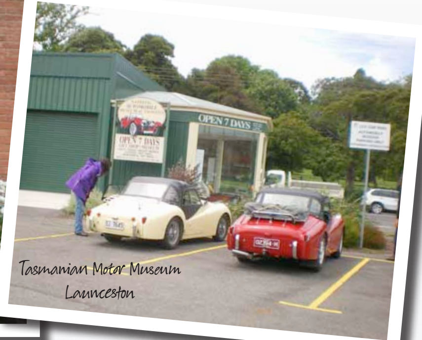
Tasmanian Motor Museum Launceston