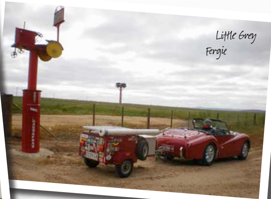
Little Grey Fergie