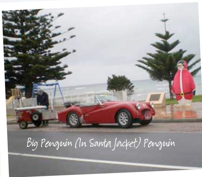
Big Penguin (In Santa Jacket) Penguin