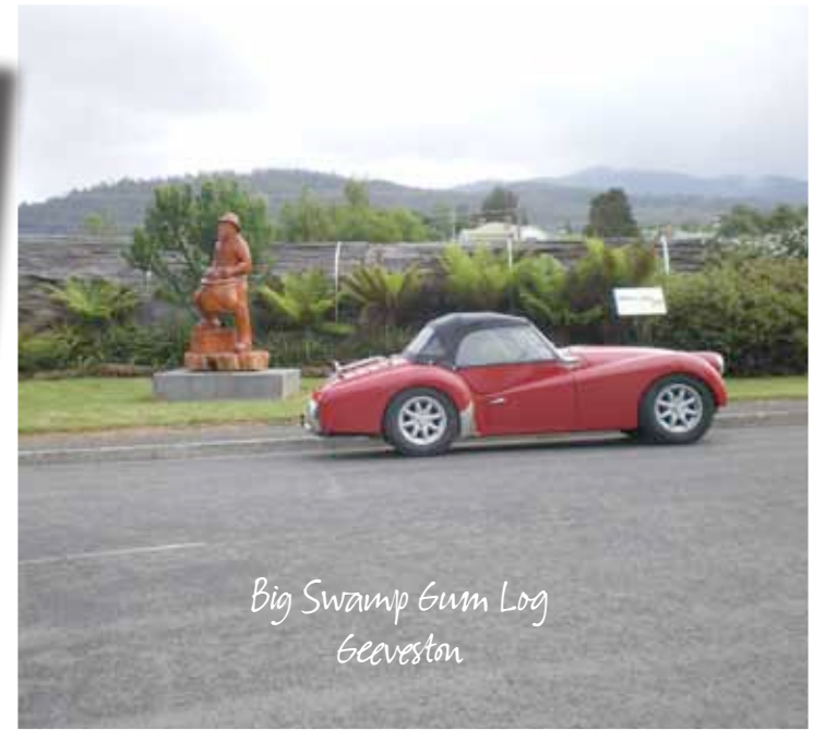
Big Swamp Gum Log Geeveston