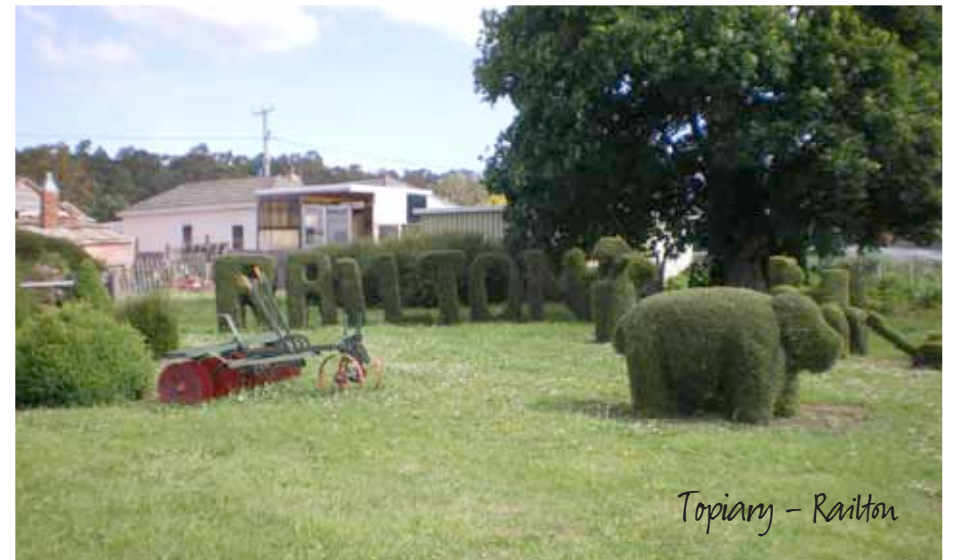
Topiary - Railton