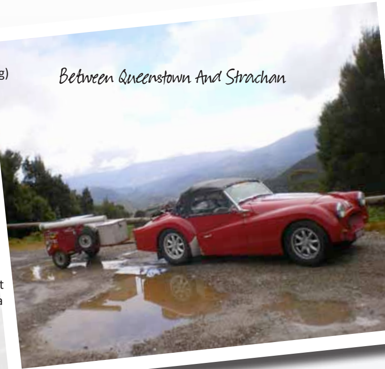
Between Queenstown And Strachan