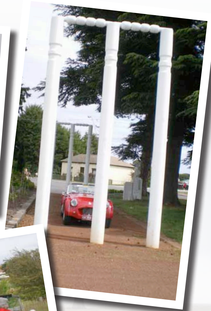
Big Wickets Westbury