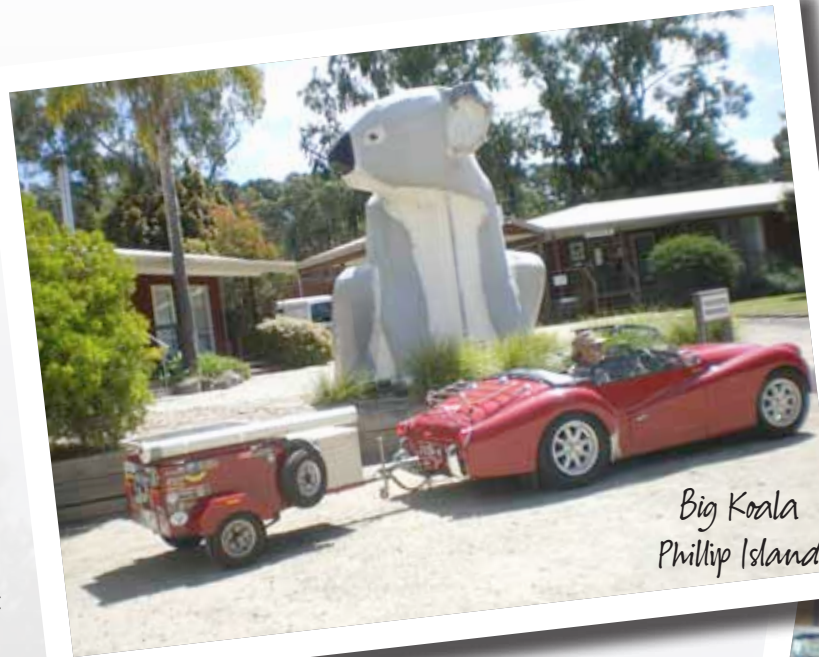
Big Koala Phillip Island

Once again the check list was all ticked off, and with "Trevor" refurbished with new tyres and a New Hood (just as well), and a Rack and Pinion Steering box, (beautiful, a great transformation), which improved the handling with or without the trailer on, we headed for Cowes, Phillip Island, for our first night, testing the new hood out in pouring rain! Arriving at Cowes at 7.30p.m.