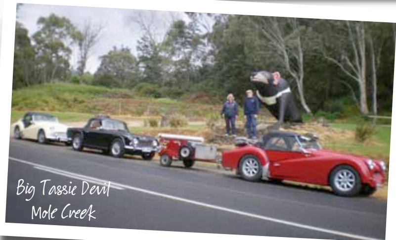
Big Tassie Devil Mole Creek