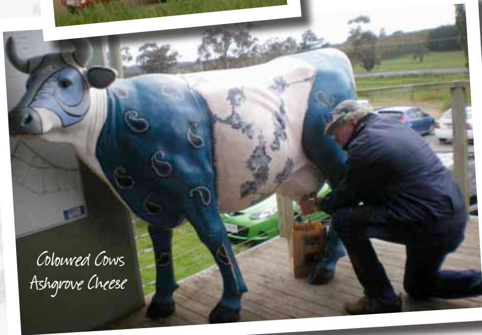
Coloured Cows Ashgrove Cheese