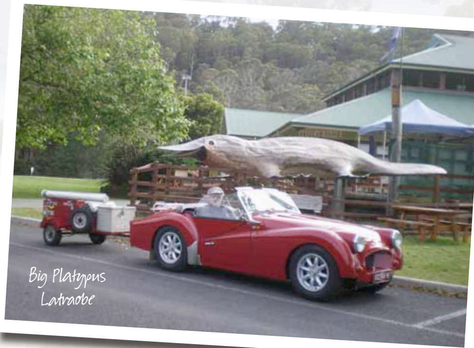
Big Platypus Latrobe