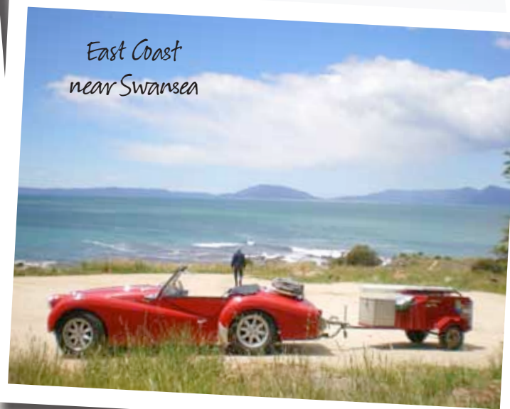
East Coast near Swansea