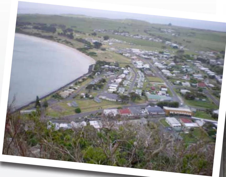
View Of Stanley