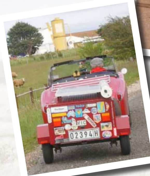
Big Coffee Pot Deloraine