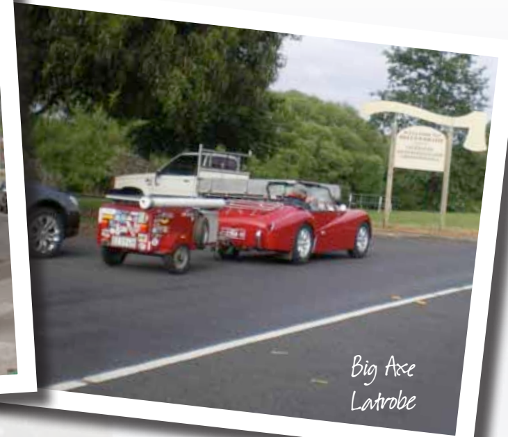
Big Axe Latrobe