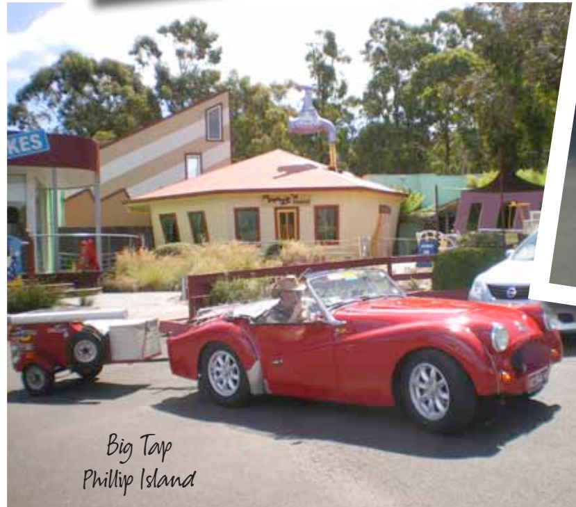
Big Tap Phillip Island

A bit of work around the house before leaving about 2.30p.m. Photos of the BIG KOALA and BIG TAP before leaving the Island we then headed for Station Pier and The Spirit of Tasmania. The boarding went smoothly as did the crossing, a few hours sleep in our Ocean Recliners and before we knew it we were docking in Devonport at about 6.00a.m. on 26th November.