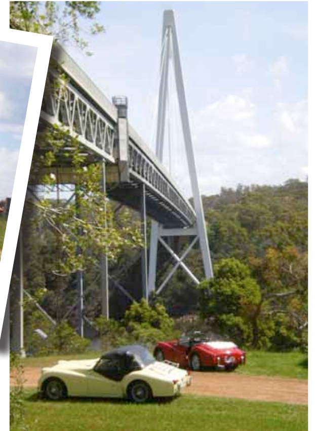
Big A Batmans Bridge