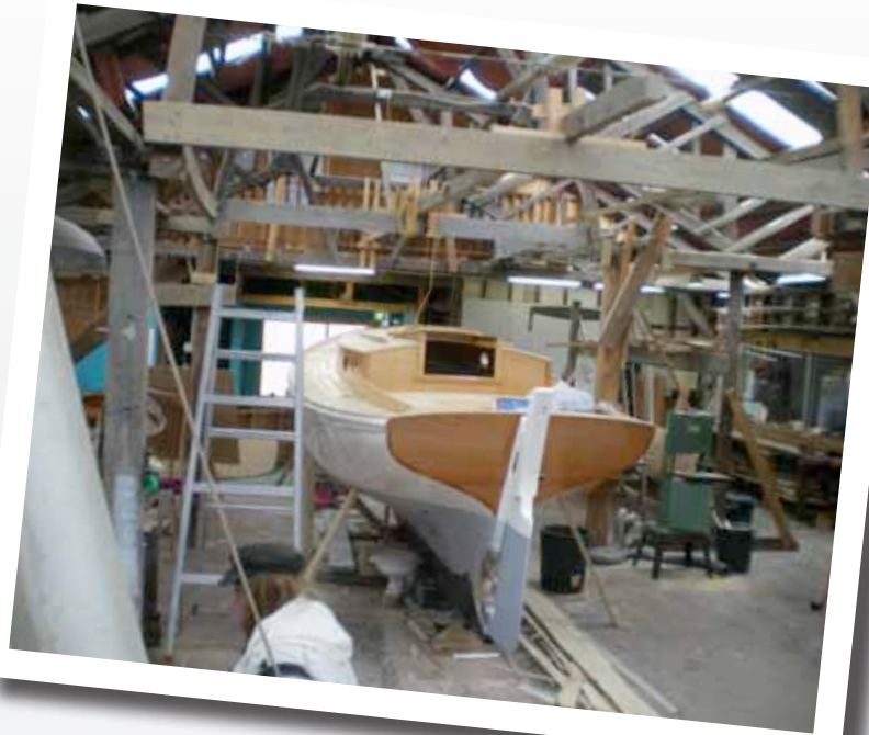
Wooden Boat Museum & School Franklin

With Shez off to work and Whitey involved in meetings, we set off in Trevor (with hood up as it was very wet) for a day trip, down in Southport, stopping in Franklin to tour the Wooden Boat Museum and School, where we marvelled at the skills and works in progress there. Lunch was had in Dover and a quick look at the Ida Bay Train. Bought yummy apples and took photo of BIG SWAMP GUM LOG in Geeveston. Back to Whiteys by 5 and out to dinner at the Ball in Chain in Salamanca for our last night in Hobart.