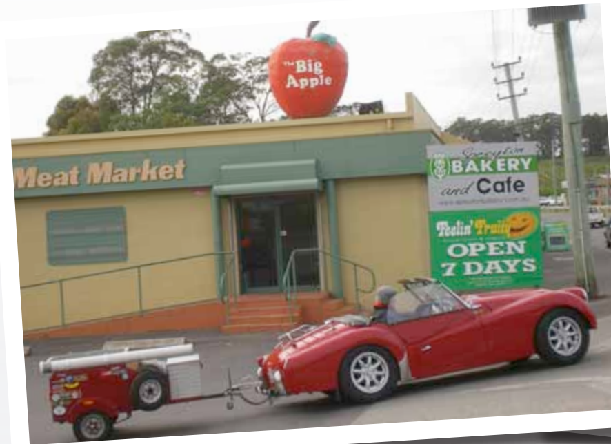
Big Apple (Not New York!) Spreyton