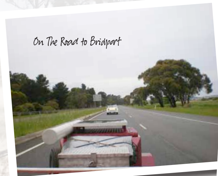
On The Road to Bridport